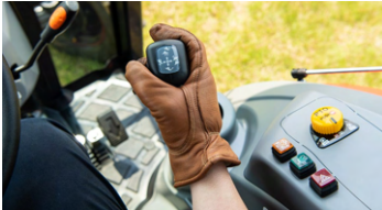
6. Joystick control for front-end loader