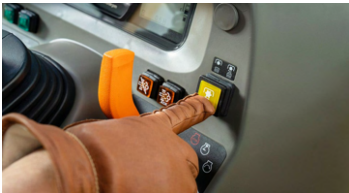
5. PTO switch