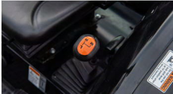
4. 8F x 8R gear transmission