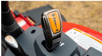
1. 2 range hydrostatic transmission (HST)