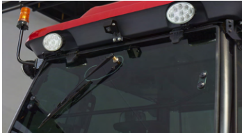
4. Reverse camera