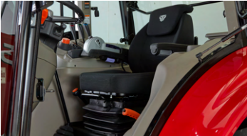
1. Air-ride full suspension seat