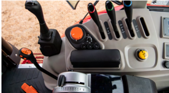
3. Ergonomic operational control center