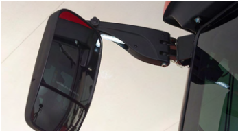
2. Side view mirrors