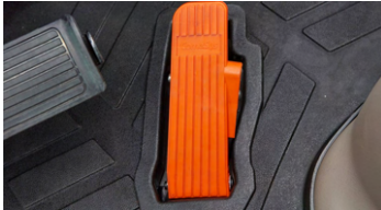
5. Organ pedal