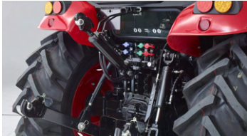
6. Telescopic top link