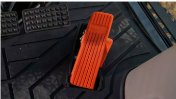
3. Electronic organ-type pedal