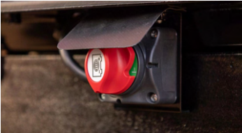
2. Battery shut-off switch