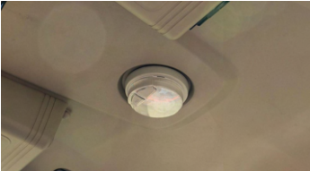
4. LED interior lighting