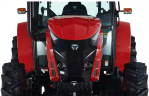
1. Tiger face front fascia