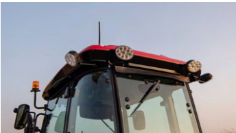
5. Side-rear LED lamp