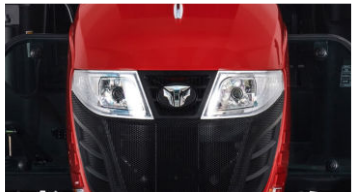
1. Hood design