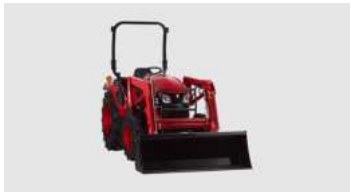
1. Optional loader with high lift capacity