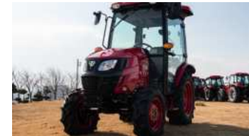
5. Foldable ROPS