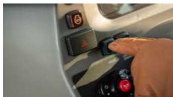
4. Optional cruise control with kit