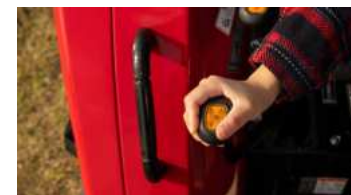
6. Joystick control for front loader