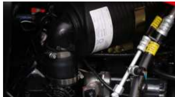
3. Dual filter air cleaner