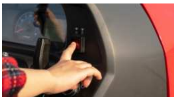
2. PTO on/off switch