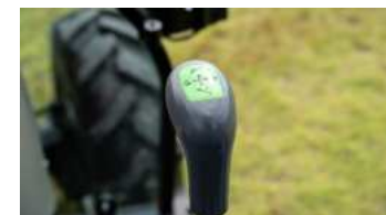
6. Joystick control for front-end loader