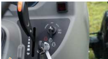
1. PTO mode switch (OFF, MANUAL, AUTO)