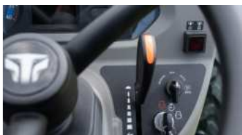
2. Throttle lever