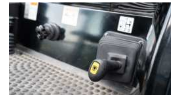
5. PTO lever