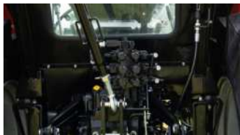
3. Rear external hydraulic valve