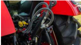
6. Hydraulic top link