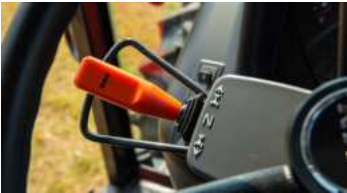
1. Power shuttle