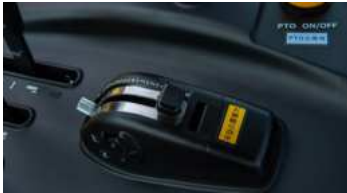
3. Electronic lift control