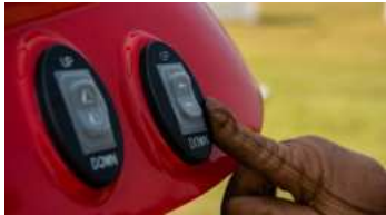
5. Rear external implement control