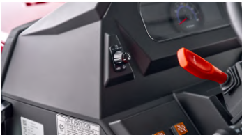
2. Shuttle sensitivity adjustment