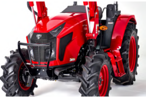
1. High-strength steel hood