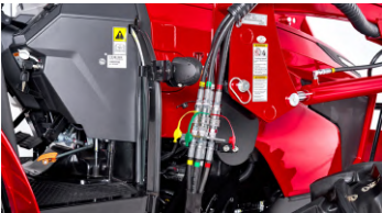
4. Front 6-port hydraulic valve