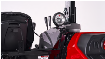
6. Working light