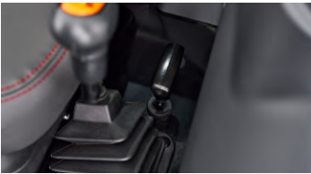
3. 4WD lever