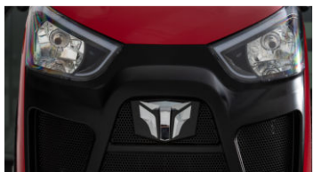
2. Projection headlights