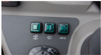
1. Cruise control switch (HST only)