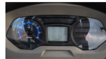
6. Digital instrument panel