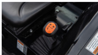
4. 3-range hydrostatic transmission