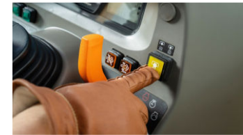
5. PTO switch