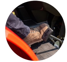
4. Highly responsive forward & reverse HST (2515H)