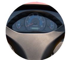
6. High visibility instrumental panel