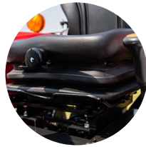
2. Comfortable suspension seat