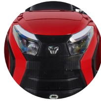
1. New iconic hood

Mid-sized Series 2 tractor designed for lasting durability. This robust and efficient tractor is fit for a range of applications of varying intensities.