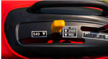
5. PTO lever