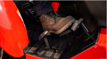
4. Responsive forward/reverse HST (2500H)