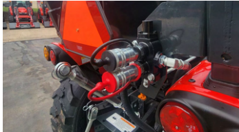
6. 2 port rear hydraulic control (optional)