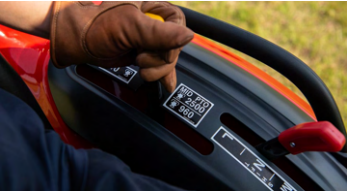
3. Ergonomic lever