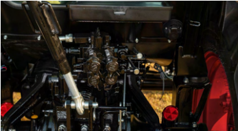
3. 2 sets of rear remote valves