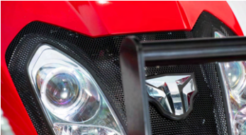
2. Projection head lamps