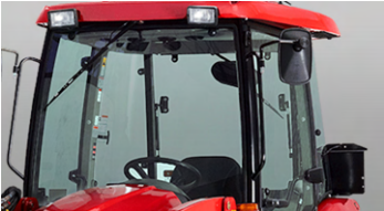
5. All-season cab