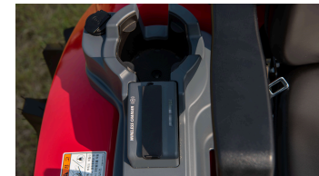
5. Wireless smartphone charger