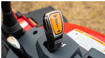
1. 2-range hydrostatic transmission (HST)