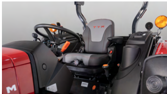
5. Comfortable suspension seat