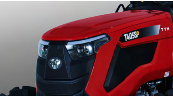
1. New iconic hood