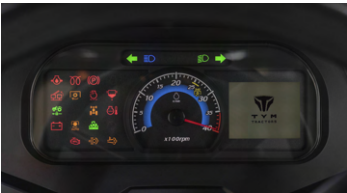
2. Digital instrument panel