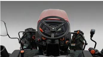
4. Tilt steering wheel