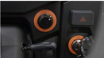
3. Electronic 4WD engagement