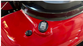
6. External hitch switch