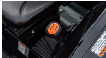
4. 3-range hydrostatic transmission