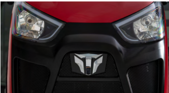
2. Projection headlights