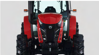
1. Tiger face front fascia