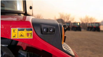
6. External hitch control buttons