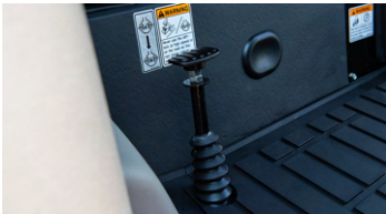
5. Differential lock system