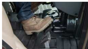
4. Responsive forward/reverse HST