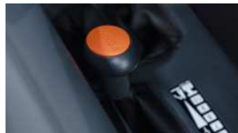
3. Ergonomic lever