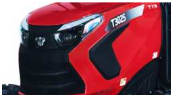
1. New iconic hood