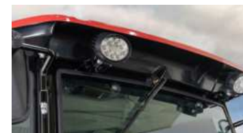
6. LED light (Standard)