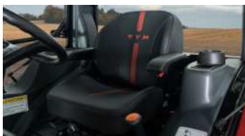
2. Comfortable suspension seat