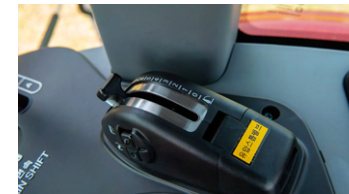
5. Electronic lift control