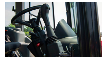
6. 6 front hydraulic ports