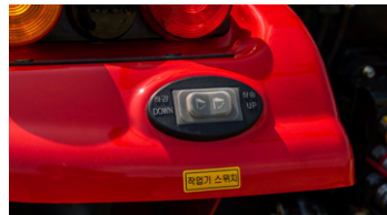
3. Implement height control