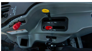
2. Ergonomic rear implement control lever