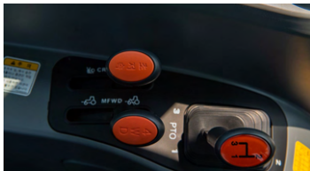
1. Low-speed / 4WD / gear shift lever