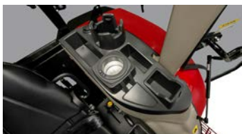
2. Cup holder, tray and USB charger