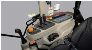
1. Ergonomic operational control center