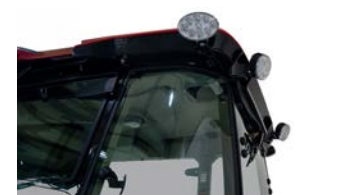
6. Side-rear LED lamp