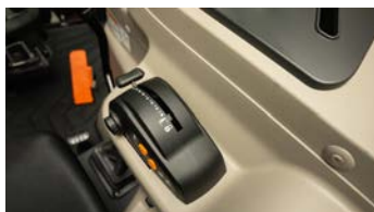
4. 3P position control