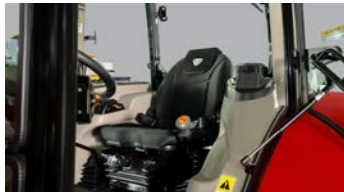
3. Suspension seat for operator comfort