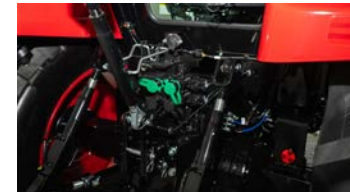
5. 4-port external rear remotes