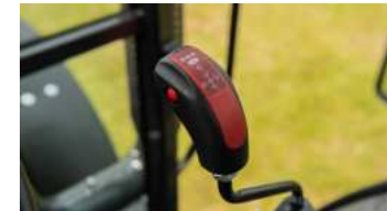
5. Loader joystick