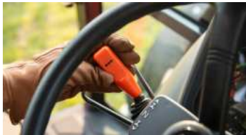
1. Power shuttle