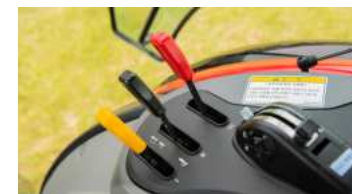
6. External hydraulic control lever