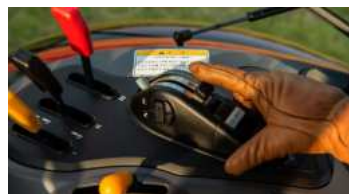
4. Electronic lift control