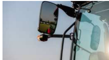
3. Dual side mirrors