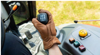
6. Joystick control for front-end loader