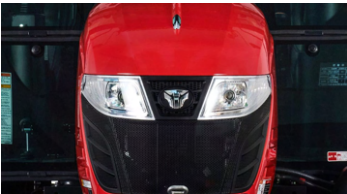
1. Hood design