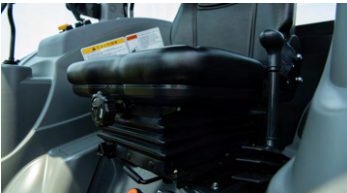
2. Comfortable suspension seat