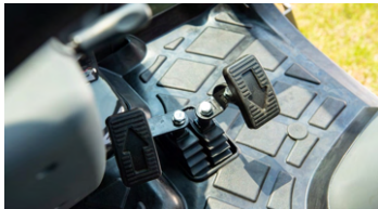
4. Highly responsive forward & reverse HST (6225CH)