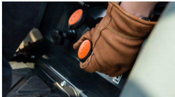
3. Ergonomic lever