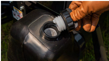
5. High-capacity fuel tank