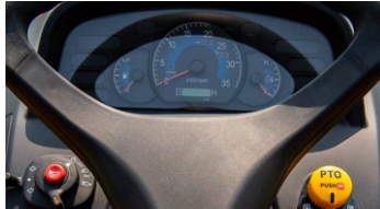
6. High visibility instrumental panel