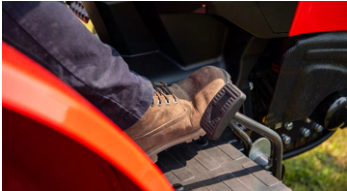
4. Responsive forward/reverse HST (2515H)