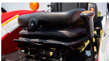
2. Comfortable suspension seat