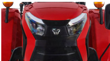
1. New iconic hood