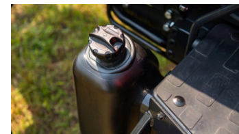
5. High-capacity fuel tank