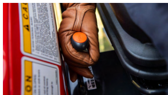
3. Ergonomic lever