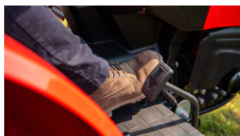
4. Highly responsive forward & reverse HST (F50HN)