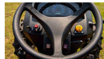
6. High visibility instrumental panel