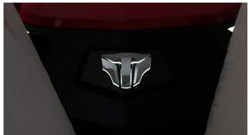
1. Backlit logo