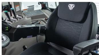
4. Adjustable suspension seat