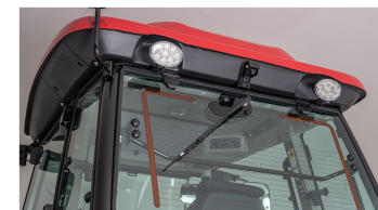
6. Heated rear window