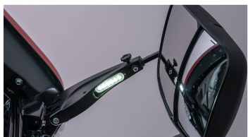
2. Sideview mirrors with LED