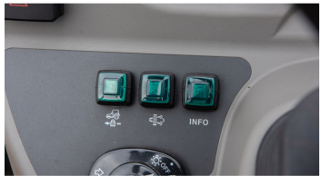
1. Cruise control switch (HST only)