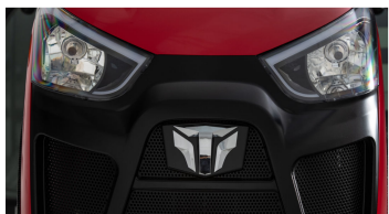
2. Projection headlights