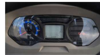
6. Digital instrument pane