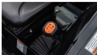
4. 3-range HST & 8F × 8R gear transmission