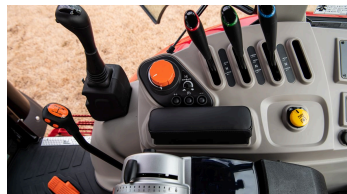
3. Ergonomic operational control center