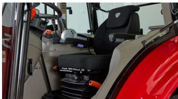
1. Air-ride full suspension seat