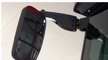
2. Side view mirrors