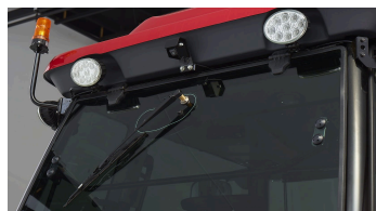
4. Reverse camera