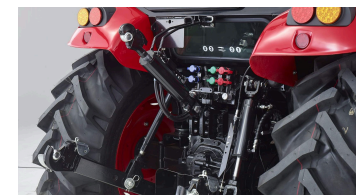
6. Telescopic top link