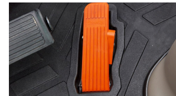
5. Organ pedal