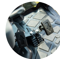
4. Highly responsive forward & reverse HST (6225CH)