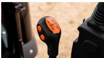
2. Powershift transmission