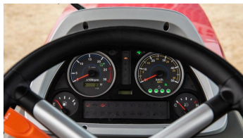
3. Digital instrument panel