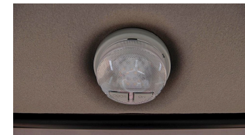
5. LED interior lighting