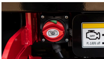
4. Battery shut-off switch