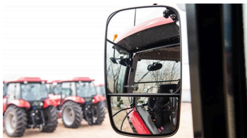
1. Dual side mirrors