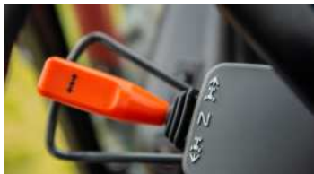
1. Power shuttle