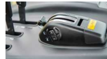
5. Electronic lift control