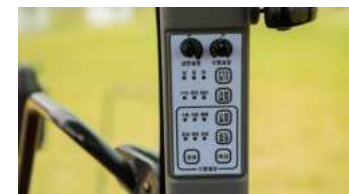
6. Multi-functional buttons