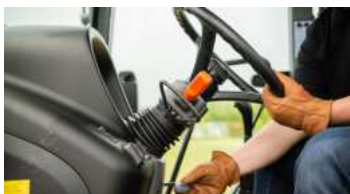
2. Hydraulic tilt / telescoping power steering