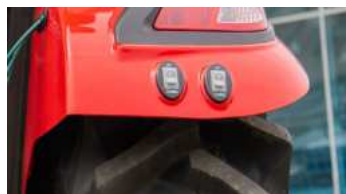
4. Rear external implement control