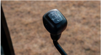
6. Joystick control for front-end loader