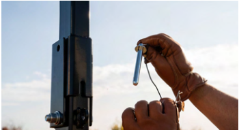
5. Foldable ROPS