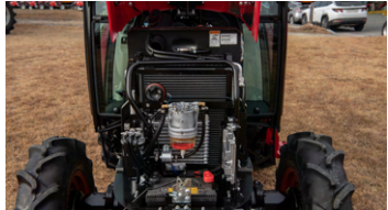
3. Dual filter air cleaner