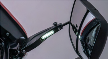
2. Side view mirrors