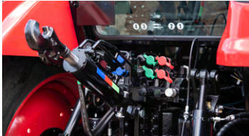
6. Telescopic top link