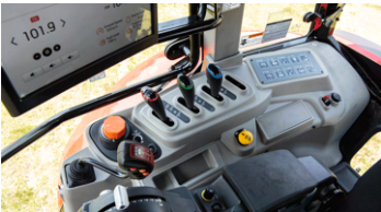
3. Ergonomic operational control center