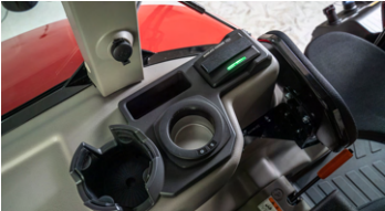
4. Smart charger and cup holder