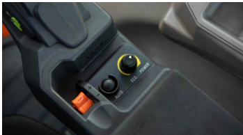
5. Shift controller, APS & drive mode dial