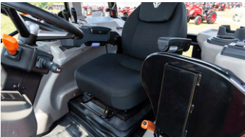
1. Air-ride full suspension seat