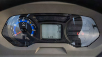
6. Digital instrument panel