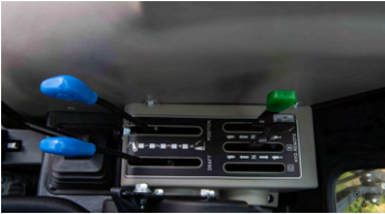
2. External lever for rear attachments