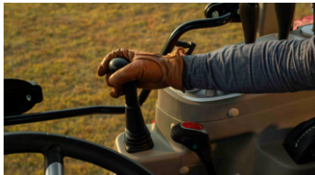
3. Joystick control for optional loader