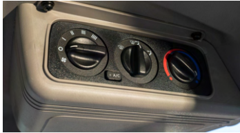
4. Cabin with heating and AC