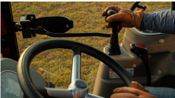
1. Hydrostatic power steering with tilt