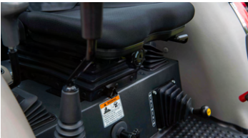
5. Suspension seat for operator comfort