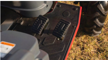
2. 2-range HST