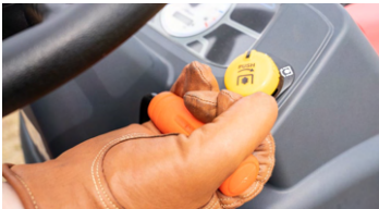
4. Throttle lever