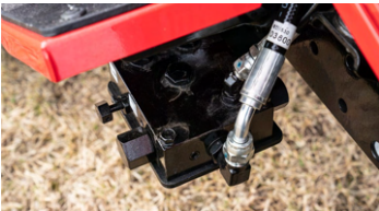
1. Linkage for optional loader