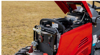
5. One-touch open hood