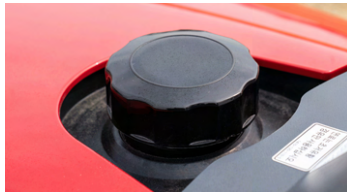
6. Large-volume fuel tank