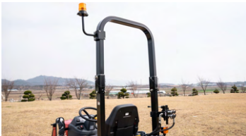
3. Foldable ROPS or all-weather cabin