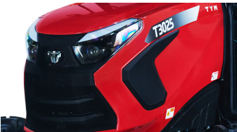
1. New iconic hood