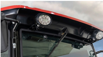
6. LED light (Standard)