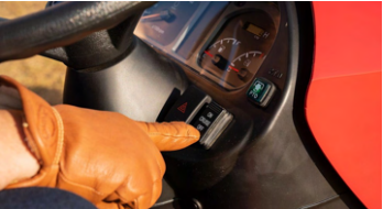
4. Cruise control