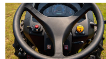
6. High visibility instrumental panel