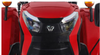
1. New iconic hood