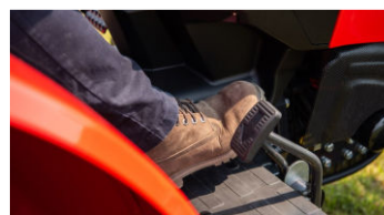
4. Responsive forward/reverse HST