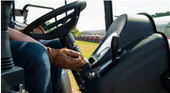
4. Tilt steering wheel