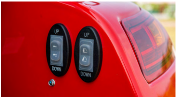
5. Rear external implement control