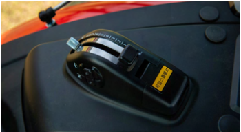
6. Electronic lift control