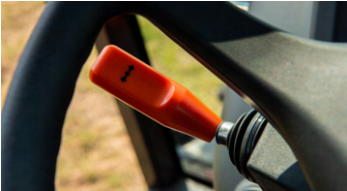
2. Power shuttle