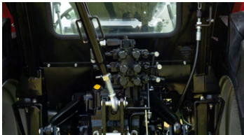
3. Rear external hydraulic valve