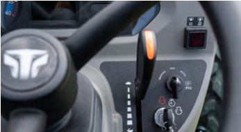
2. Throttle lever