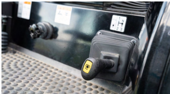
5. PTO lever