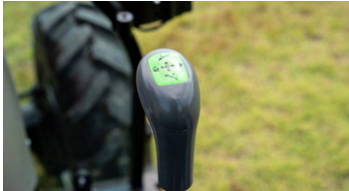
6. Joystick control for front-end loader