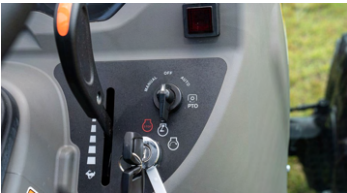
1. PTO mode switch (OFF, MANUAL, AUTO)