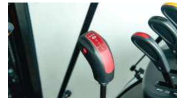
6. Premium loader joystick lever