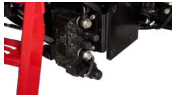
3. 6-port front external hydraulic system