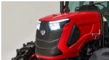
1. Sleek hood design