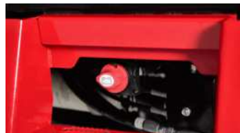
4. Battery shut-off switch