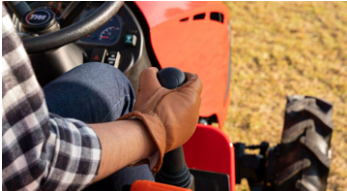
6. Joystick control for front loader