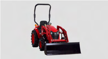
1. Optional loader with high lift capacity