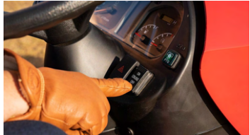
4. Cruise control