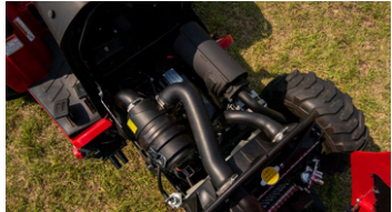
3. Dual filter air cleaner