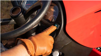
2. PTO on/off switch