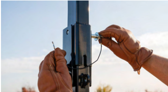
5. Foldable ROPS