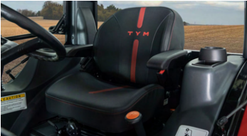
2. Comfortable suspension seat