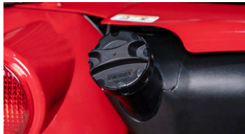
5. High-capacity fuel tank