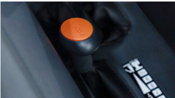
3. Ergonomic lever