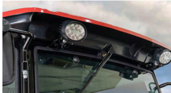
6. LED light (Standard)