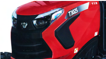
1. New iconic hood