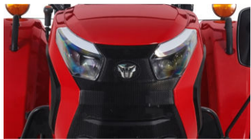
1. New iconic hood