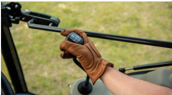
6. Front-end loader joystick lever