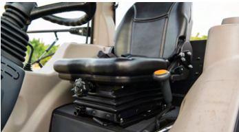
2. Comfortable suspension seat