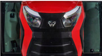
1. New iconic hood