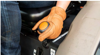
3. Ergonomic lever