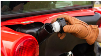
5. High-capacity fuel tank