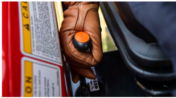
3. Ergonomic lever