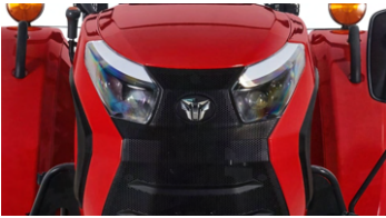
1. New iconic hood