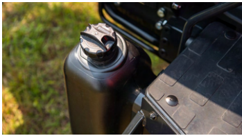
5. High-capacity fuel tank