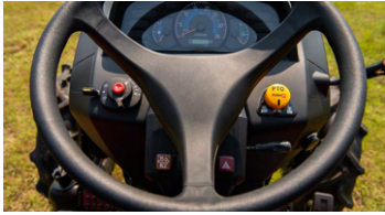
6. High visibility instrumental panel