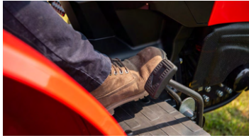
4. 4 wheel drive