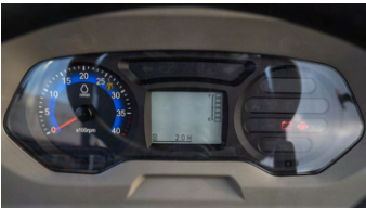
6. Digital instrument panel