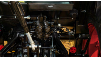
3. 4-port rear hydraulic valve