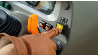
5. PTO switch