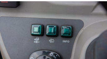
1. Cruise control switch