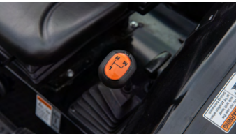
4. 3-range hydrostatic transmission