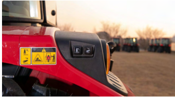
6. External hitch control buttons