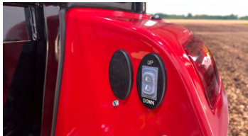
6. External hitch switch