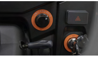
3. Electronic 4WD engagement