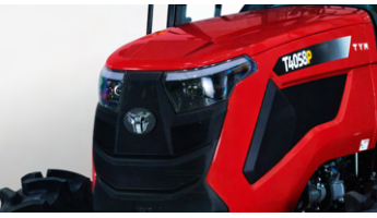
1. New iconic hood