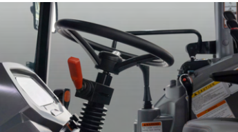
2. Tilt steering wheel