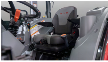
5. Comfortable suspension seat