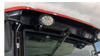
6. LED light (Standard)