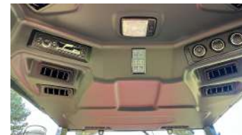
5. Defrost and A/C vents