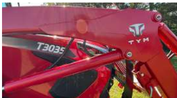
1. New iconic hood