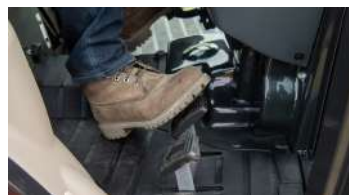
4. Responsive forward/reverse HST